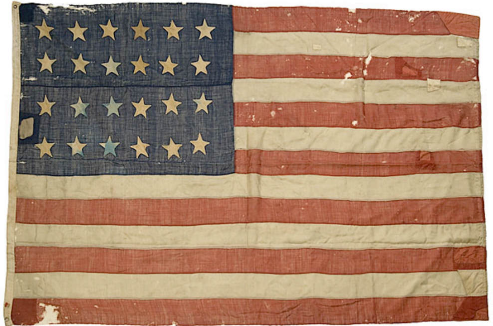
A twenty-four star U.S. flag of the type in use at the time Senator Webster gave this speech

While the Union lasts we have high, exciting, gratifying prospects spread out before us, for us and our children. Beyond that I seek not to penetrate the veil. God grant that in my day at least that curtain may not rise! God grant that on my vision never may be opened what lies behind! When my eyes shall be turned to behold for the last time the sun in heaven, may I not see him shining on the broken and dishonored fragments of a once glorious Union; on States dissevered, discordant, belligerent; on a land rent with civil feuds, or drenched, it may be, in fraternal blood!